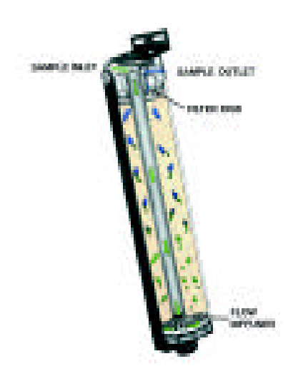
Figure 1 - Flow Schematic

Ammonia reacts with phosphoric acid, forming ammonium phosphate. This relatively high melting point salt immediately deposits inside the ammonia scrubber, removing it from the gas stream. The reaction is quite selective, and does not affect the concentrations of other gases in the steam.